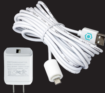
PWR-WL5V-2A POWER CABLE