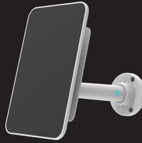
SOL-12V SOLAR PANEL